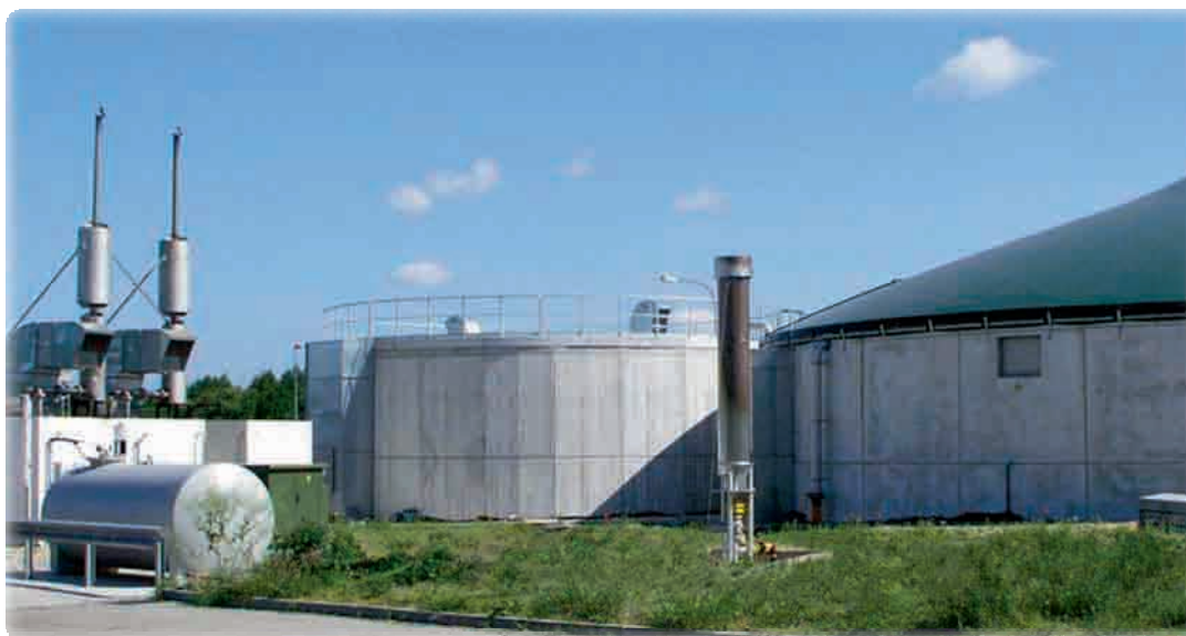
Example of similar plant in Germany