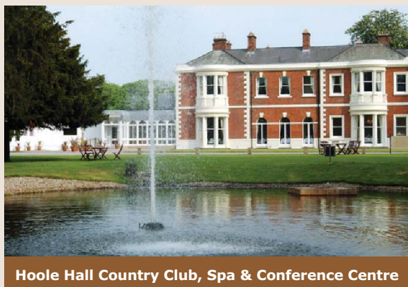
Hoole Hall Country Club, Spa & Conference Centre

Following its purchase in July 2008, there has been extensive refurbishment at The Thames Club, a health and leisure club in Staines, with work being completed in September 2009. Work included moving the gym and creating additional studios. During this work the club remained open to members and is now well positioned to capitalise on this further investment which will allow for an increased drive on membership numbers over the coming months and years.